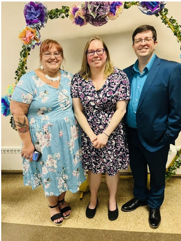
The Tea Party in May was very well attended and raised funds for mission projects. A wonderful time was had by all! See more photos on page 10 & 11.

Most of all I appreciate your time to pray for me. I need courage to get through the day and to not worry about falling. Your kindness is so thoughtful.