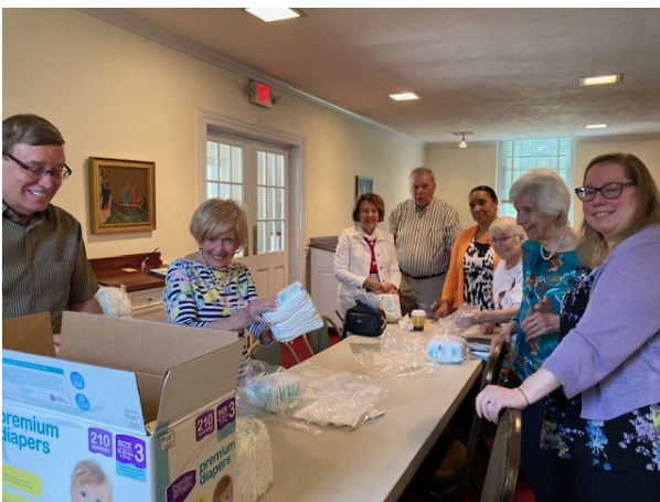
The Mission Committee thanks everyone who stayed after the service on May 26 to bundle over 1,100 diapers for Maker's Place in Trenton.